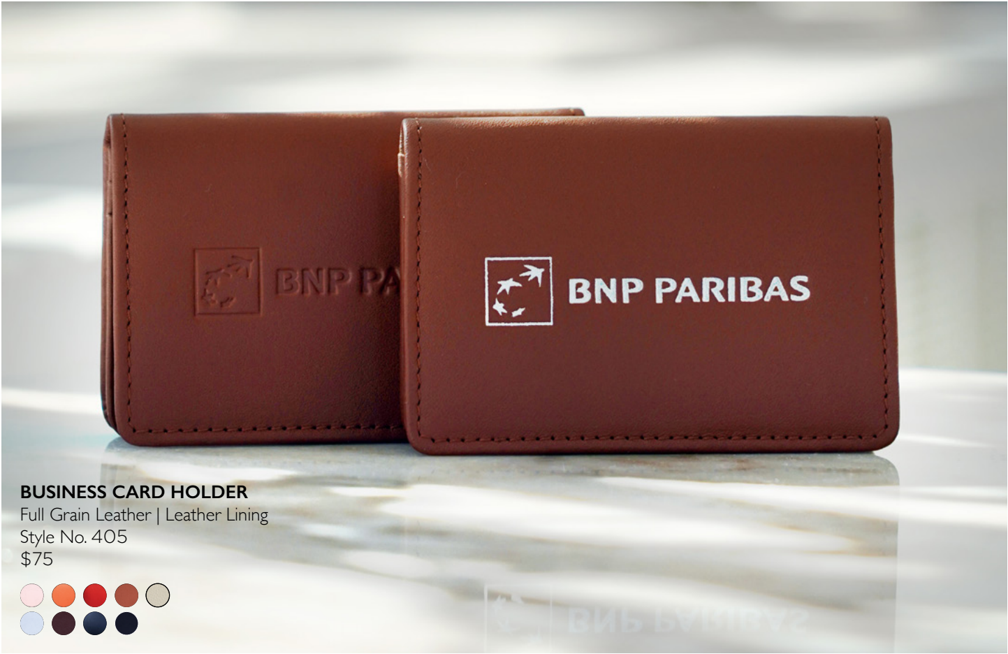
BUSINESS CARD HOLDER Full Grain Leather | Leather Lining Style No. 405 $75