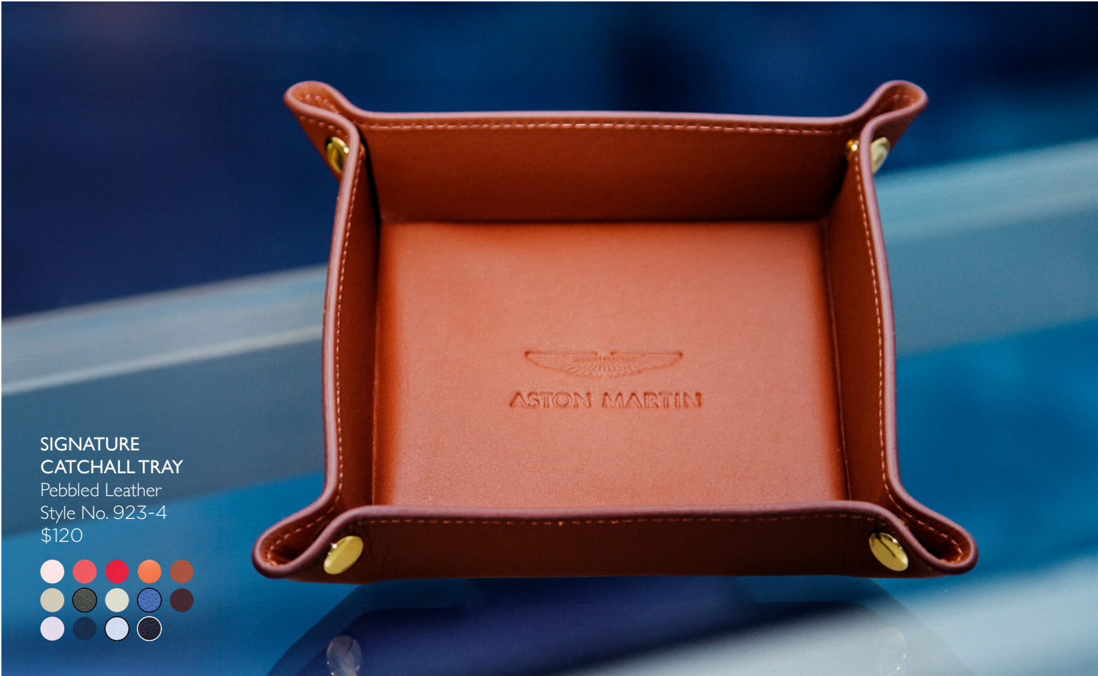
SIGNATURE CATCHALL TRAY Pebbled Leather Style No. 923-4 $120