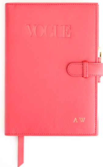
VOGUE FORCES OF FASHION CONFERENCE GIFTS