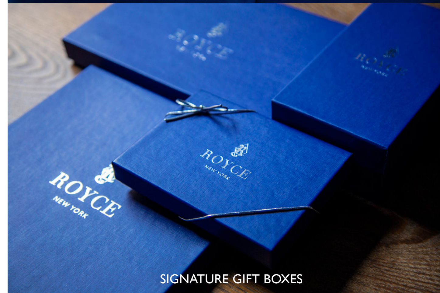
SIGNATURE GIFT BOXES