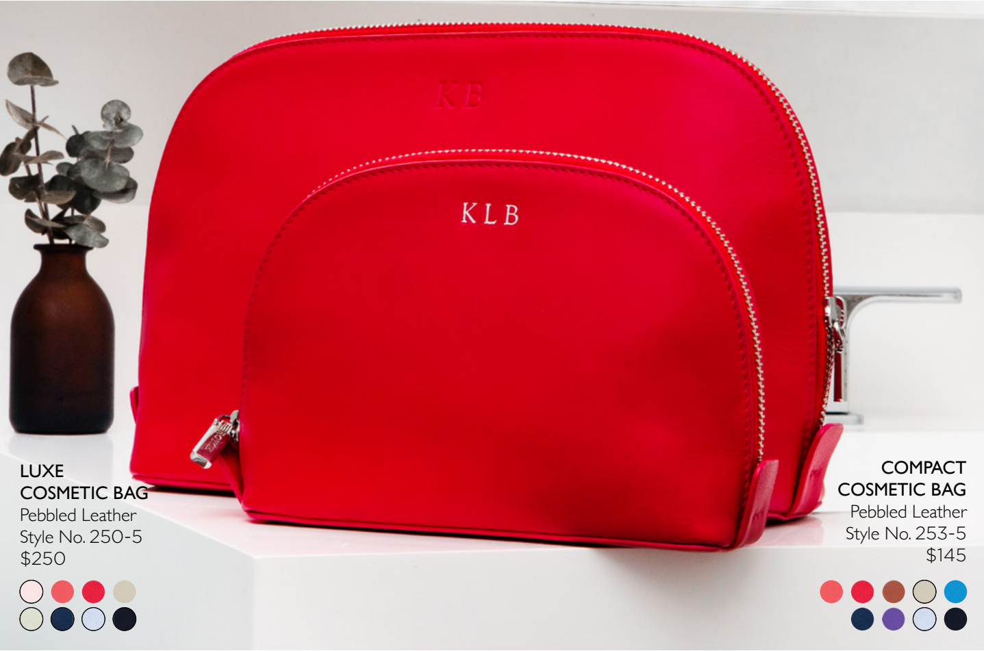
LUXE COSMETIC BAG Pebbled Leather Style No. 250-5 $250