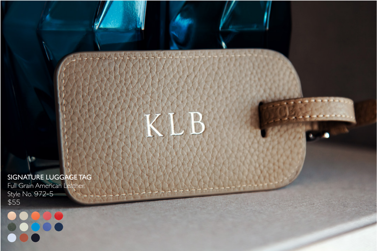
SIGNATURE LUGGAGE TAG Full Grain American Leather Style No. 972-5 $55