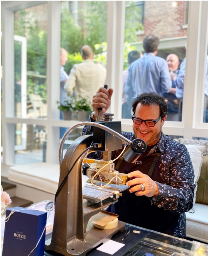
ROYCE LIVE MONOGRAMMING ACTIVATION FOR INVESTOR DAY SUMMIT