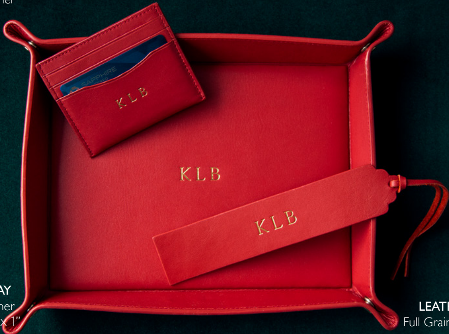
LARGE CATCHALL TRAY Full Grain American Leather Dimensions: 9.75" x 8" x 1" Style No. 982-5 $175