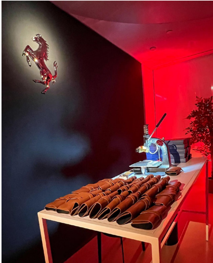
ROYCE LIVE MONOGRAMMING ACTIVATION FOR FERRARI PRIVATE CLIENT DINNER