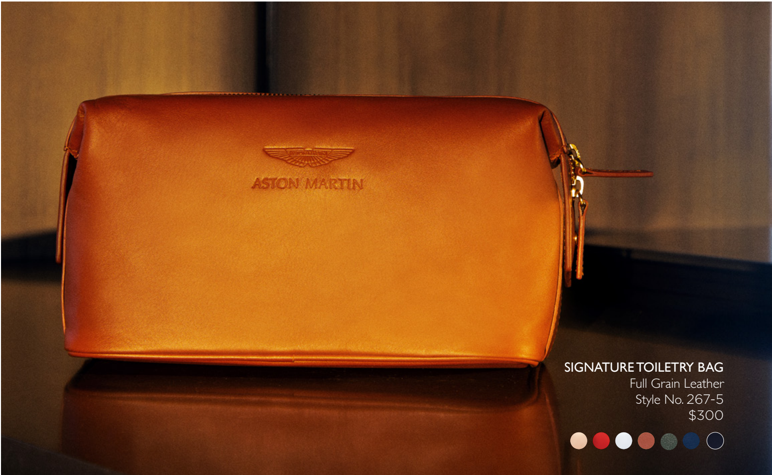
SIGNATURE TOILETRY BAG Full Grain Leather Style No. 267-5 $300