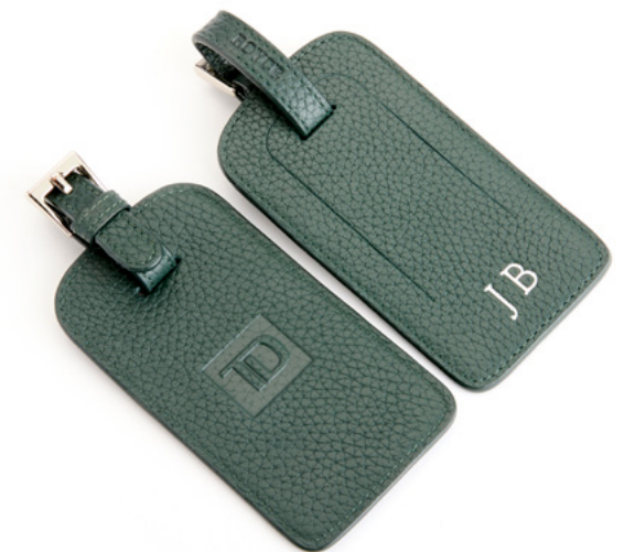
TD BANK CLIENT GIFTS