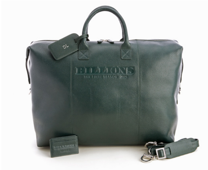
BILLIONS ON SHOWTIME SERIES FINALE CAST & CREW GIFTS

Experience the richness and durability of our American leather goods, ready to be transformed into personalized treasures. From travel essentials to executive items, our wide range of products are crafted to meet the highest standards of quality and design.