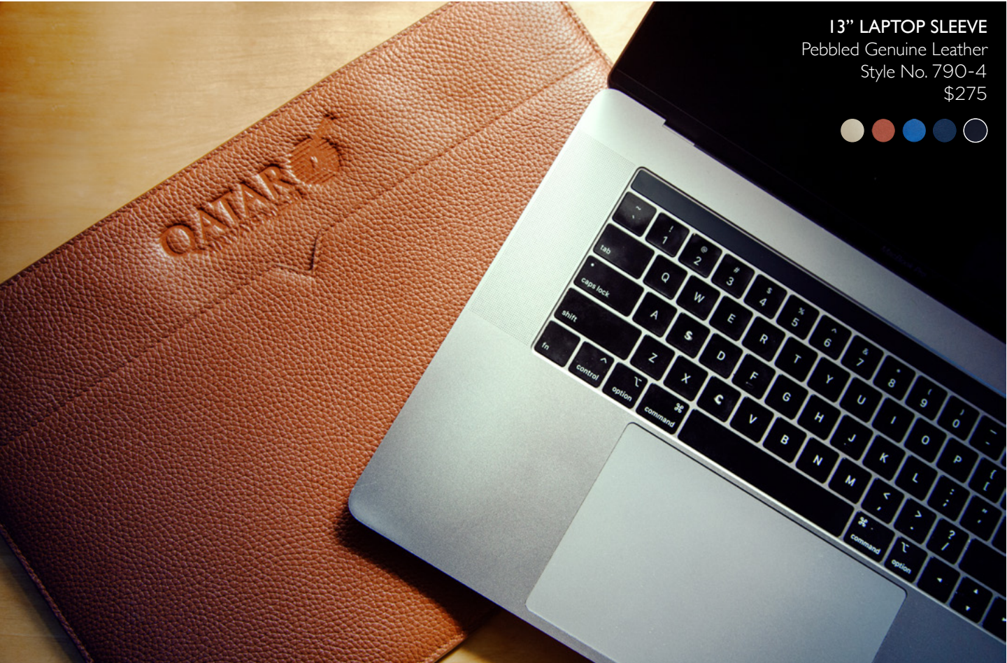
13" LAPTOP SLEEVE Pebbled Genuine Leather Style No. 790-4 $275