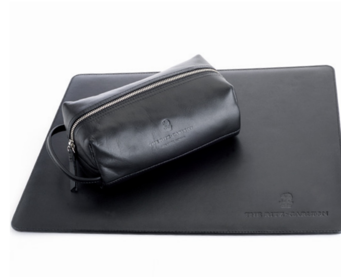
THE RITZ-CARLTON HOTELS ROOM ACCESSORIES