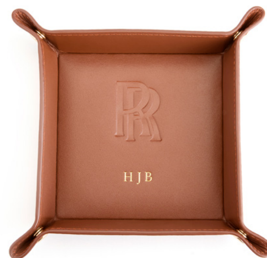
ROLLS-ROYCE DEALERSHIP OPENING GIFTS