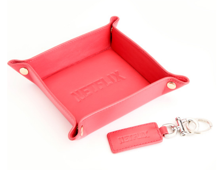
NETFLIX CLIENT GIFTS