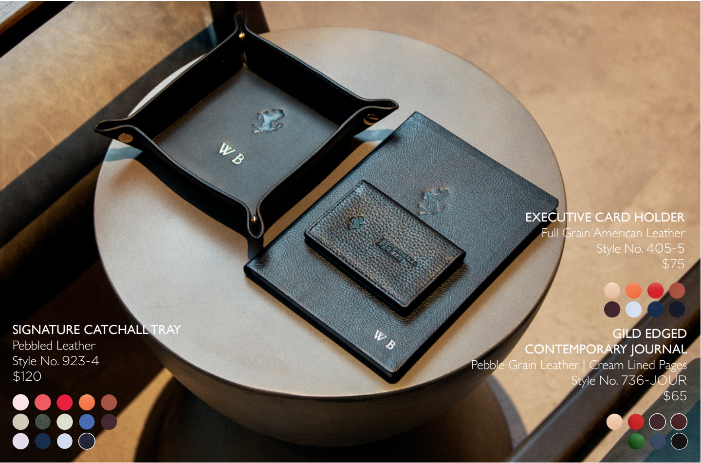
EXECUTIVE CARD HOLDER Full Grain American Leather Style No. 405-5 $75