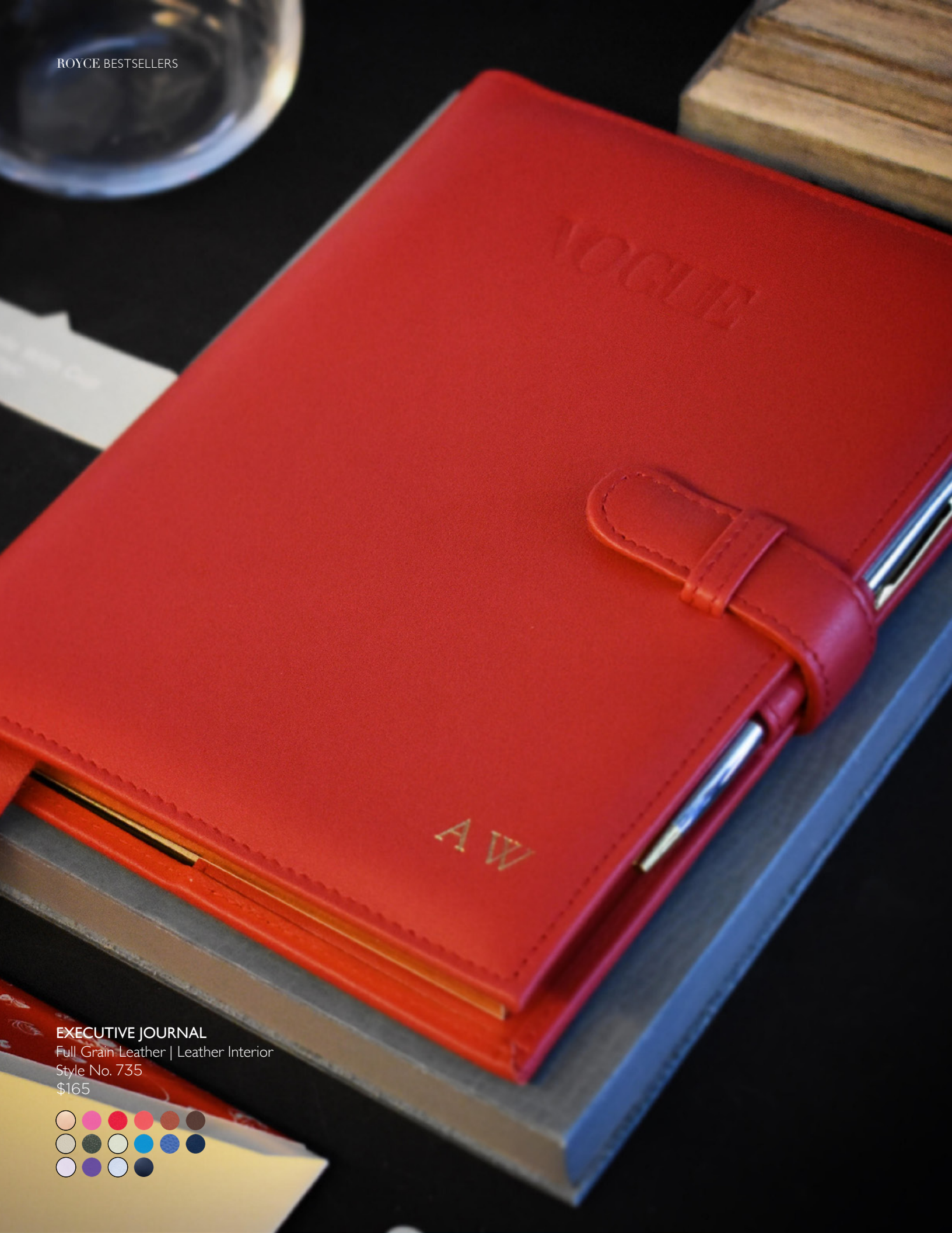
EXECUTIVE JOURNAL Full Grain Leather | Leather Interior Style No. 735 $165