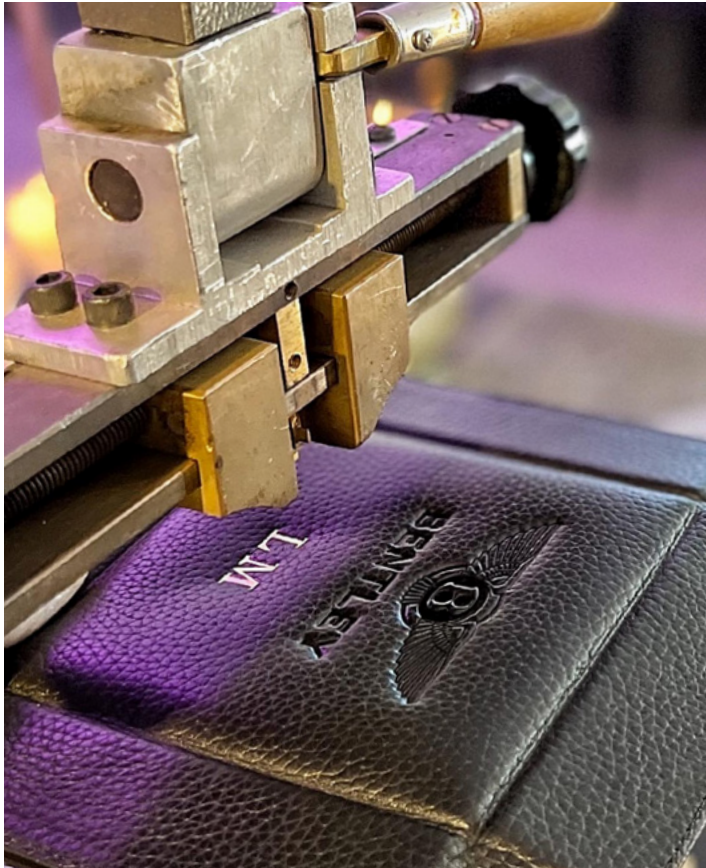
ROYCE LIVE MONOGRAMMING ACTIVATION FOR BENTLEY DEALERSHIP OPENING PARTY