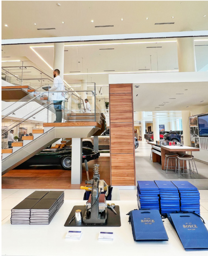
ROYCE LIVE MONOGRAMMING ACTIVATION FOR ASTON MARTIN MIAMI