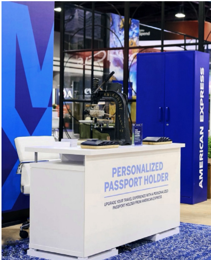
ROYCE LIVE MONOGRAMMING ACTIVATION FOR AMERICAN EXPRESS