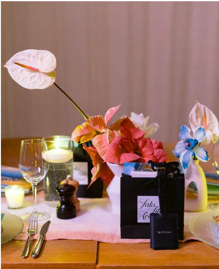
ROYCE MONOGRAMMING GIFTING FOR SAKS FIFTH AVENUE DINNER