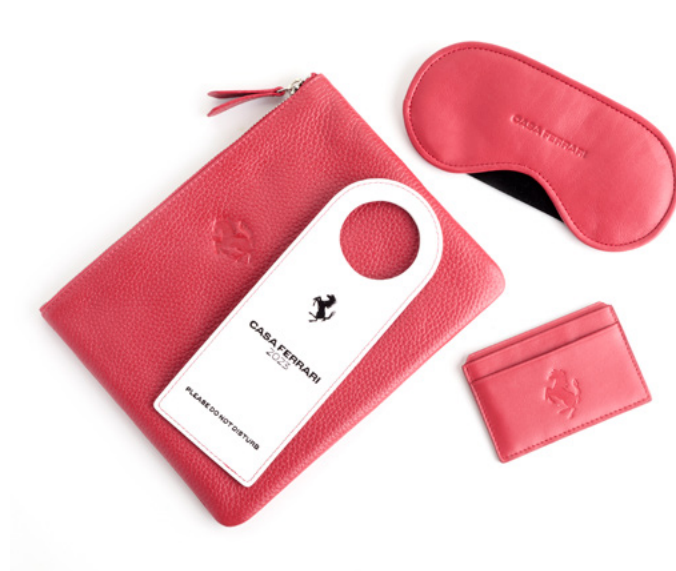
CASA FERRARI PEBBLE BEACH CLIENT GIFTS