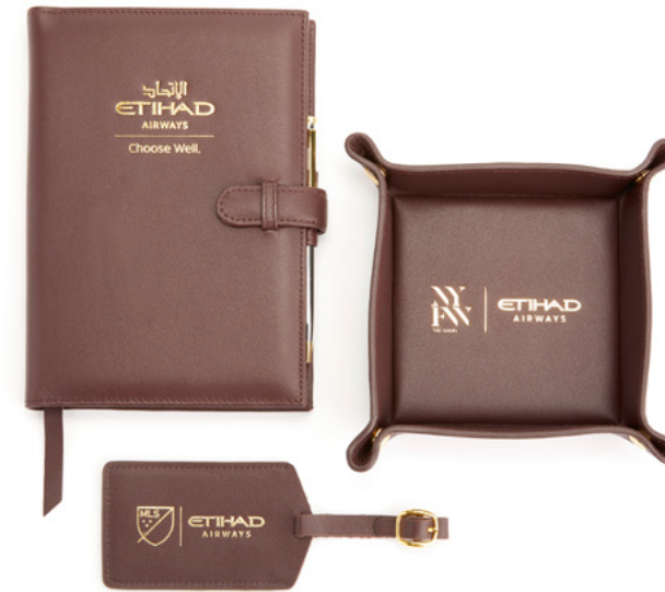
ETIHAD AIRWAYS NYFW AND MLS ALL STAR GAME GIFTS